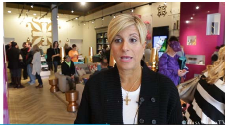
Posted: Saturday, January 16, 2016 12:00 am | Updated: 1:42 pm, Wed Feb 10, 2016.